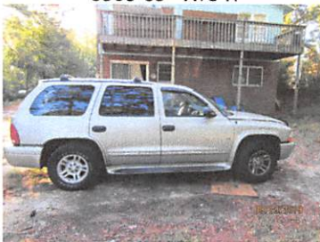
6505 65th Ave N