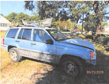
1903 N Ocean Blvd