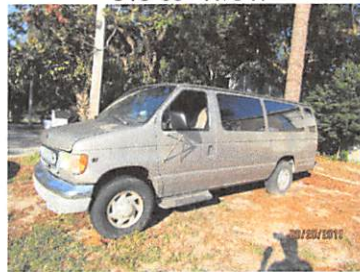
513 65th Ave N