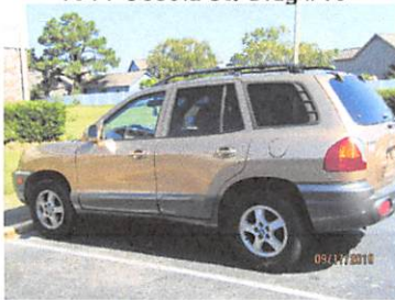
1011 Oceola St. Bldg #10