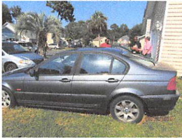
827 Branda Pl.