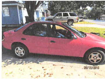
1402 Ben Oaks Dr.