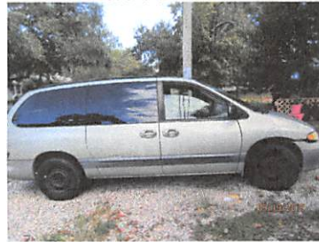
407 71st Ave N