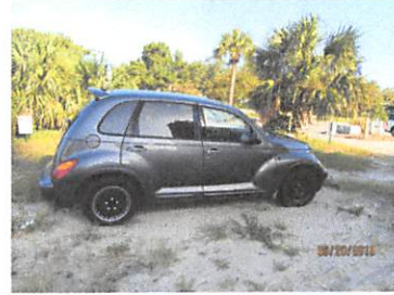
1903 N Ocean Blvd