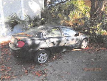
6315 Wildwood Trail