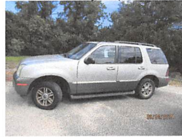
17 th Ave S /Hwy 15 (Vacant lot)