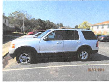
1011 Oceola St. Bldg #10