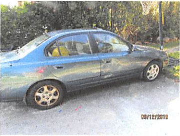
1302 Melanie Ln