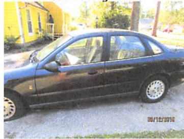
1930 Pridgen Rd.