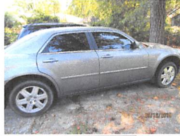
1201 Page St.