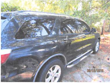
1201 Page St.